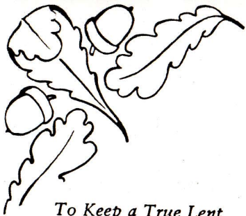
To Keep a True Lent

Today we hear how Jesus began his ministry. He was tempted in the desert for forty days in solitude, fasting and praying and returned to proclaim the powerful message of God – repent and believe the Good News. St. Peter explains how, by baptism, we join our lives to Christ and are saved, just as Noah and his family were saved by water long ago.