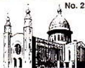
CHURCH OF THE HOLY SPIRIT, ST. JAMES'S CROSS, COBK.