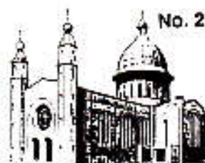
CHURCH OF THE HOLY SPIRIT DENNEHYSCROSS COBK

Thirty-Second Sunday in Ordinary Time. (Prisoners' Sunday)