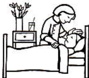
Visit the sick

(Of course, you always have the option of donating the fruits of your astuteness to charity - in the true spirit of Christmas!).