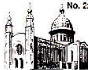
CHURCH OF THE HOLY SPIRIT DENNY'S CROSS, CORK