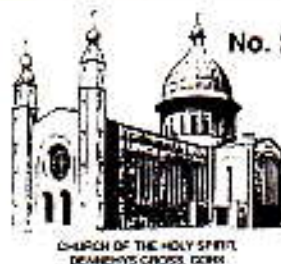
CHURCH OF THE HOLY SPIRIT, DEANEYS CROSS, CO. RM