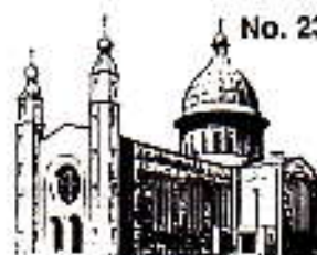
CHURCH OF THE HOLY SPIRIT DENHEYS CROSS, CO. DK.