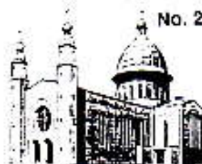
CHURCH OF THE HOLY SPIRIT, DENNEY'S CROSS, COBK