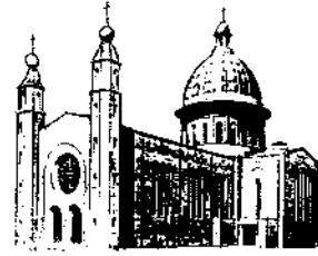
CHURCH OF THE HOLY SPIRIT, DENNEHYS CROSS, CORK