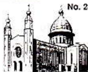
CHURCH OF THE HOLY SPIRIT, DENHEGHS CROSS, DORK