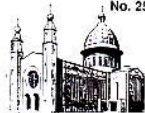
CHURCH OF THE HOLY SPIRIT 16-NORTH CROSS ROAD