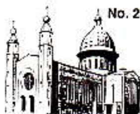
CHURCH OF THE HOLY SPIRIT SENIOR'S CROSS, DOOR