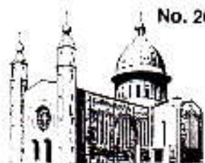
CHURCH OF THE HOLY SPIRIT BALLINEASPAIG, CORK