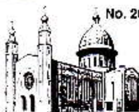
CHURCH OF THE HOLY SPIRIT DENNY'S CROSS, CO. DK