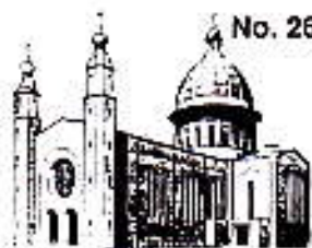
CHURCH OF THE HOLY SPIRIT, DENREHYS CROSS, CORK