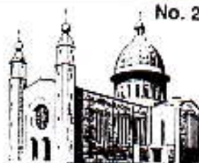
CHURCH OF THE HOLY SPIRIT, DE RWBY'S CROSS, COOK.