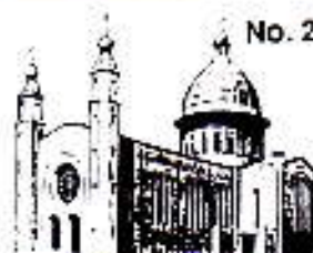
CHURCH OF THE HOLY SPIRIT, DUNBARHYG CROSS, LIGGEE