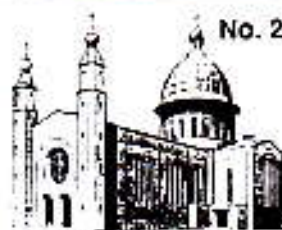
CHURCH OF THE HOLY SPIRIT, DENEHYS CROSS, CO. RM