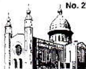
CHURCH OF THE HOLY SPIRIT OF BALLYVAUGHAN, CO. DUBLIN