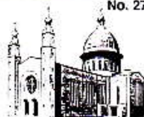
CHURCH OF THE HOLY SPIRIT, DENNEY'S CROSS, 1246K