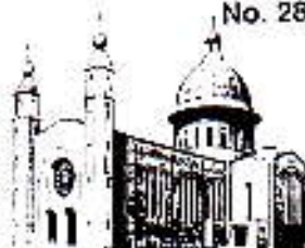
CHURCH OF THE HOLY SPIRIT, DENVER, COLORADO