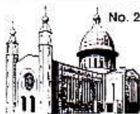
DI-OC-E-S-E OF THE HOLY SPIRIT DENECHYS CROSS, CO. PA.