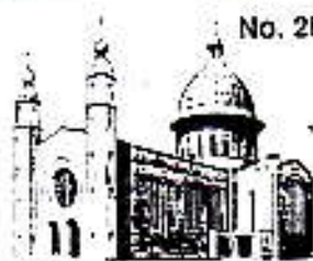
CHURCH OF THE HOLY SPIRIT DENNEWISH, CO. WICK.