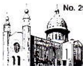
CHURCH OF THE HOLY SPIRIT 15 WINGS CROSS CORR.