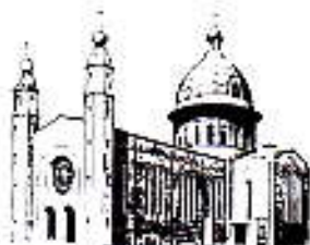
CHURCH OF THE HOLY SPIRIT DENNEHY'S CROSS, CORK