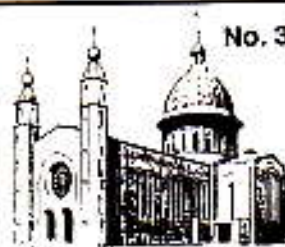
CHURCH OF THE HOLY SPIRIT DEARLEIGH CROSS, COBK