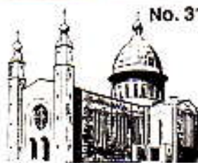
CHURCH OF THE HOLY SPIRIT, CENWEGY CROSS, CO. WK.