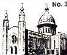
CHURCH OF THE HOLY SPIRIT, DEARHYS CROSS, CO. DK.