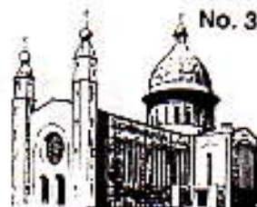
CHURCH OF THE HOLY SPIRIT, DENHAYS CROSS, DUBLIN