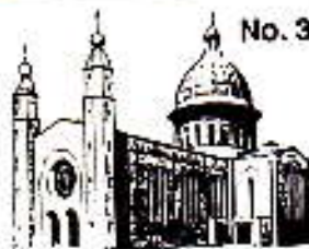
CHURCH OF THE HOLY SPIRIT, DENMEYS CROSS, IORN