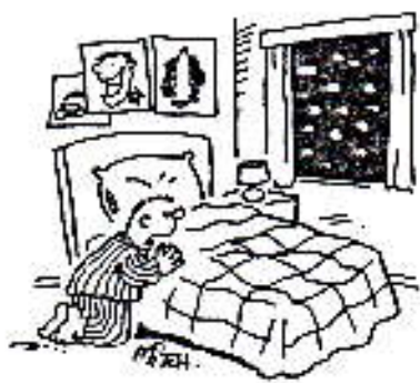
"... AND PLEASE MAKE IT SNOW DEEP ENOUGH TO STOP ME GETTING TO SCHOOL..."

This appeal is to ask organisers of Church Gate Collections to carry out their collection outside the church gates, in adherence with the Garda Siochana permit.