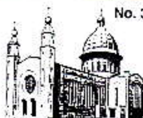
CHURCH OF THE HOLY SPIRIT, DENEHYS CROSS, CO. CO. CO.