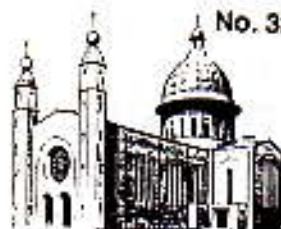
CHURCH OF THE HOLY SPIRIT, DENNETT'S CROSS, CO. WEX.