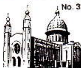
CHURCH OF THE HOLY SPIRIT, DENNDY'S CROSS, CO.KE