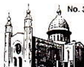
CHURCH OF THE HOLY SPIRIT DENNEY'S CROSS, COBK