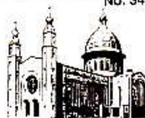
CHURCH OF THE HOLY SPIRIT DEWING'S CROSS, COBK