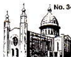
CHURCH OF THE HOLY SPIRIT, CLONFERT, CO. GAL.