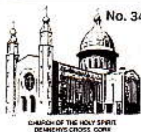
CHURCH OF THE HOLY SPIRIT DEANE'S CROSS, CORK