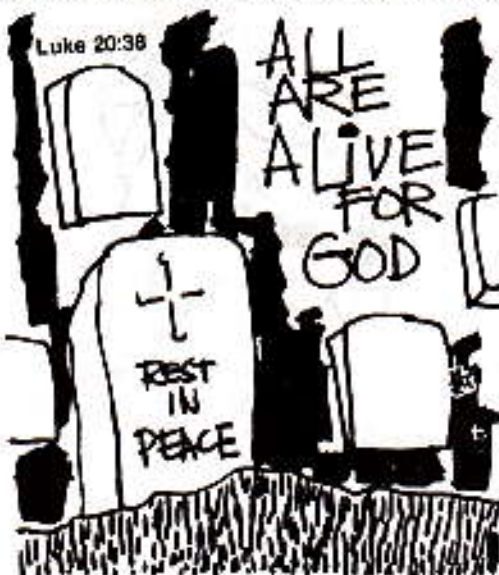
32nd Sunday of the Year - C

Cookery Demonstration on Tuesday 9th November at 8 p.m. in the SMA Parish Centre, followed by Skin care and beauty make over. Admission £3.