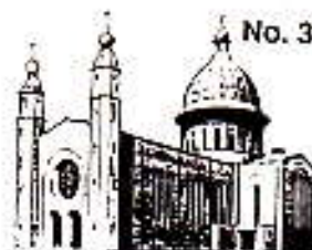
CHURCH OF THE HOLY SPIRIT, DENEHY'S CROSS, CO. RR.