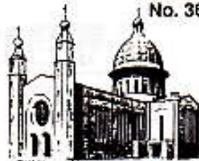
CHURCH OF THE HOLY SPIRIT, DENARDY'S CROSS, DUBLIN