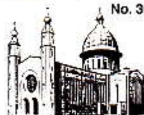
CHURCH OF THE HOLY SPIRIT, OF WELLS'S CROSS, CO. Wick