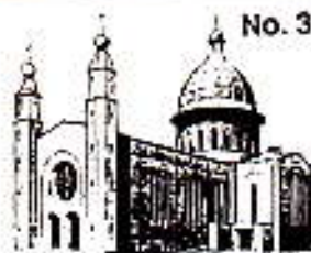
CHURCH OF THE HOLY SPIRIT DENEHY'S CROSS, DORK