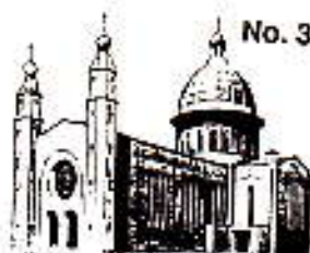
CHURCH OF THE HOLY SPIRIT DEWEEN'S CROSS, CO. DK.