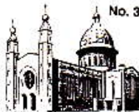
CHURCH OF THE HOLY SPIRIT, DERRINYS CROSS, COBK