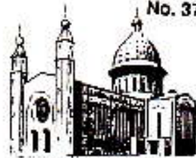
CHURCH OF THE HOLY SPIRIT, DENMENYS CROSS, DORN