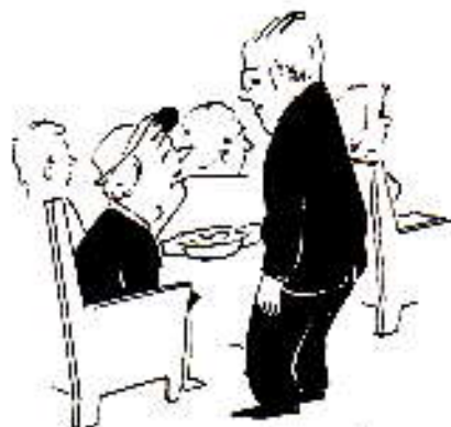
DO YOU TAKE MASTER CARD?