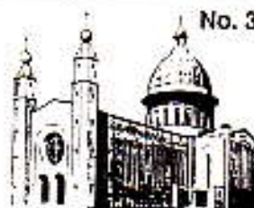
CHURCH OF THE HOLY SPIRIT DENNEY & CROSS, COOK