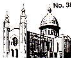
CHURCH OF THE HOLY SPIRIT, DENEHETS CROSS, CO. DK.