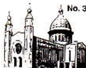
CHURCH OF THE HOLY SPIRIT DE WENHYS CROSS, CORAK