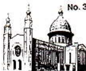
CHURCH OF THE HOLY SPIRIT, DENEHY'S CROSS, COBK