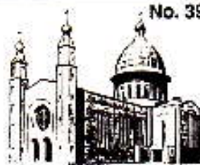
CHURCH OF THE HOLY SPIRIT, DENWYD'S CROSS, CORK