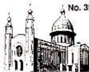
CHURCH OF THE HOLY SPIRIT, DENRY'S CROSS, CO. RM.