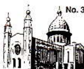
CHURCH OF THE HOLY SPIRIT DERRIFHYA CROSS, CO. K.